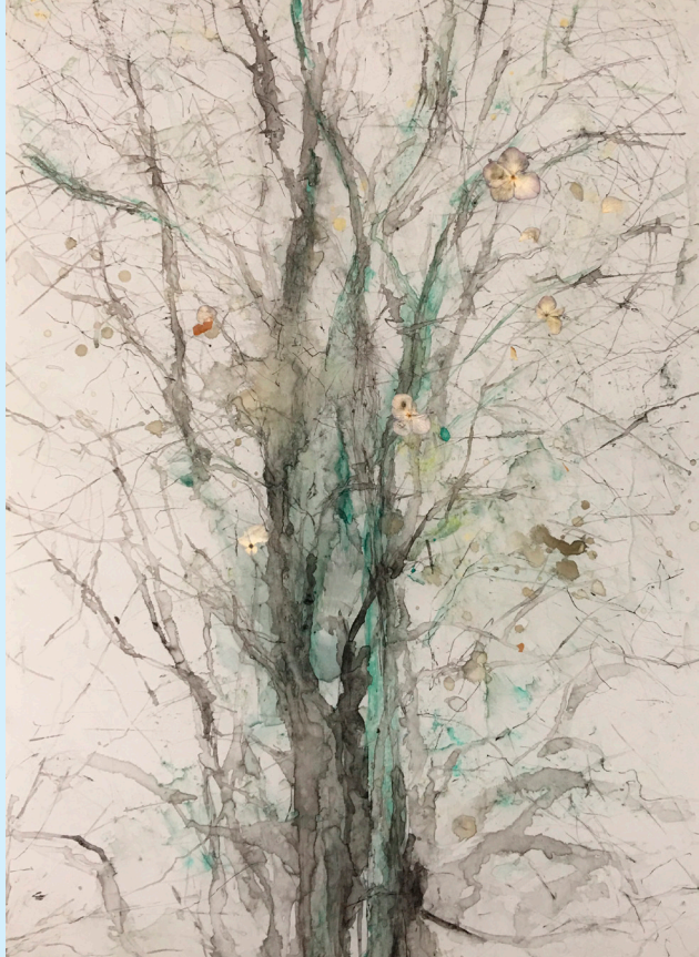
Tony Yin Tak Chu, Wood Series #8, 2018, mixed media on paper, 20 x 16 inches