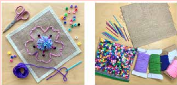
Above: Contents of RAGA School Art Program Art Making Kit.