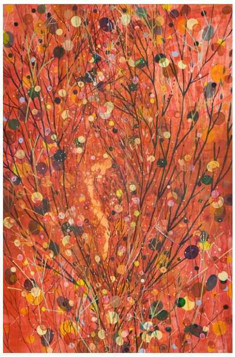
Landon Mackenzie, Wild Red, 2008, Synthetic polymer on linen

Many of Landon Mackenzie's paintings evoke the idea of Movement . Look at examples of artwork with movement, and discuss with students what they see and feel.