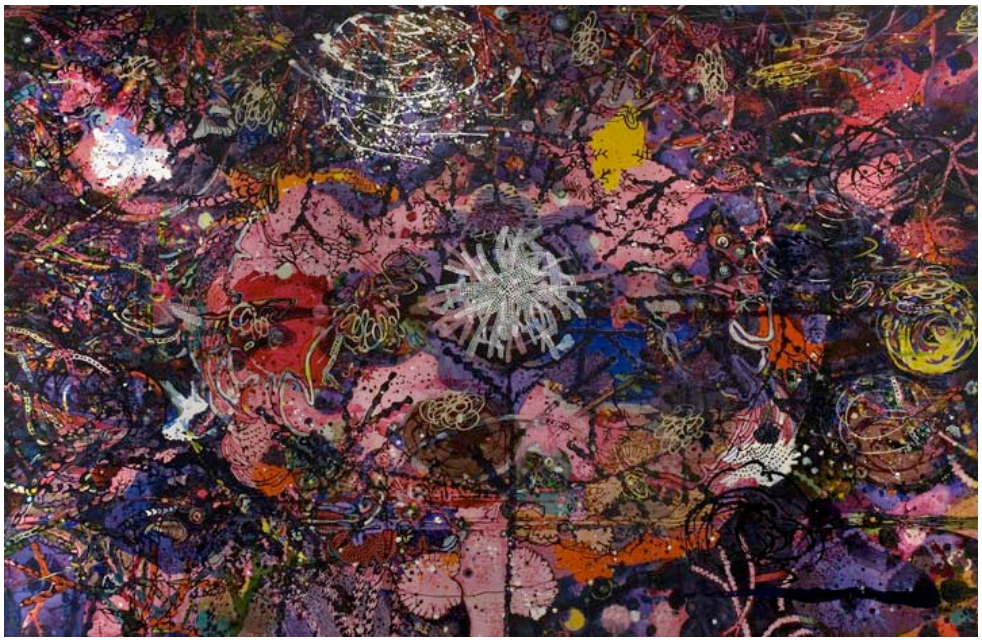
Landon Mackenzie, Circle of Willis, 2006, 218.44cm x 330.2 cm, synthetic polymer on linen