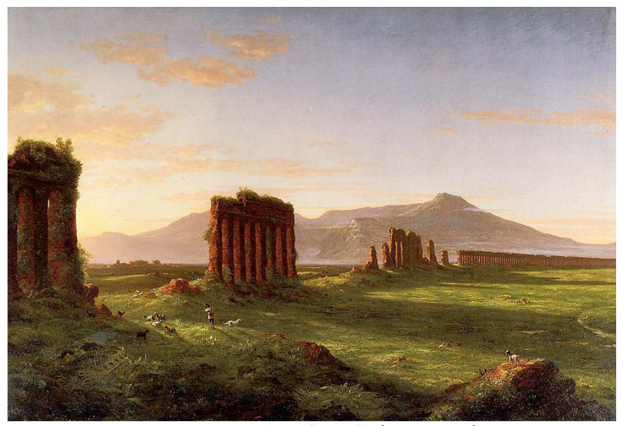
Roman Campagna (1843) Thomas Cole

The columns are the same size in reality, but the artist has used scale to make it look like some of the columns are close, and some far away. This is why objects are BIG in the foreground, medium sized in the middle ground, and tiny in the background.