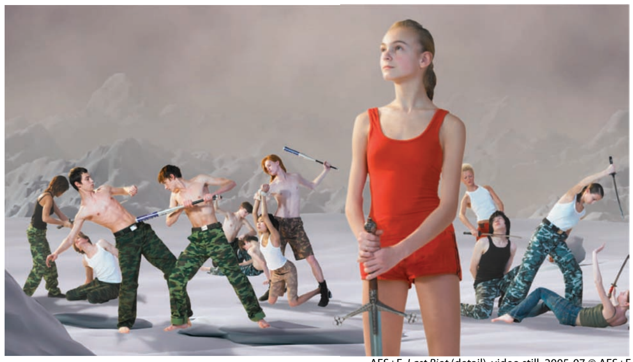
AES+F, Last Riot (detail), video still, 2005-07 © AES+F