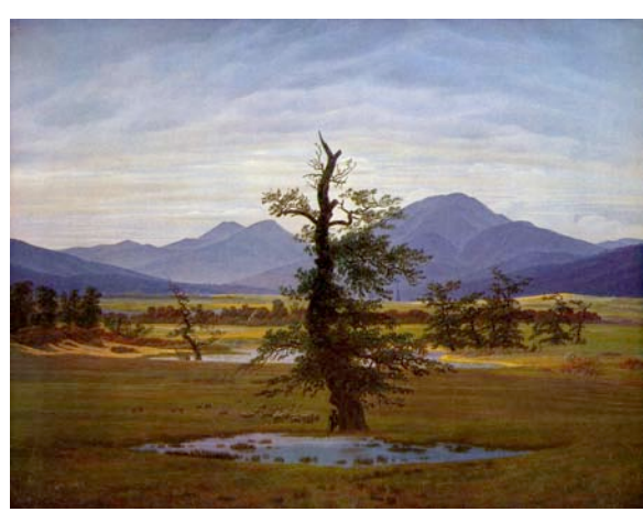
Einsamer Baum, (1822) by Caspar David Friedrich