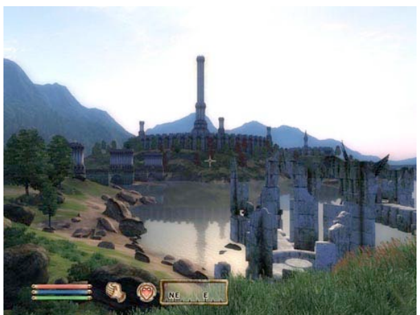
The Elder Scrolls IV: Oblivion (screenshot) © Bethesda Softworks