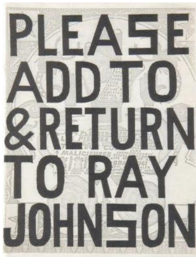
Mail Art by Ray Johnson

Mail Art (aka Postal or Correspondence Art) is a worldwide cultural movement that involves sending visual art, music, sound art, or poetry through the international postal system. Mail Art grew as an expressive art form in the early 1950's, and its current form is believed to have started