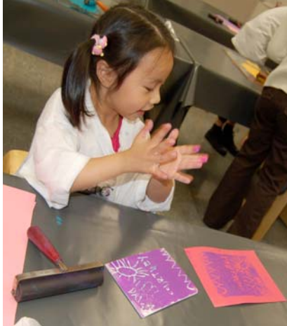
Student printmaking in the studio