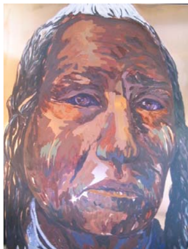
Charlene Vickers – Redwing He Gives Honour (Paint on copper)

Use images of local city landscapes, stencils, collage, and various drawing materials to create a layered image of modern life with technology.