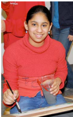
Student in the art studio painting with watercolours

Explore creating the illusion of space in a mixed-media painting.